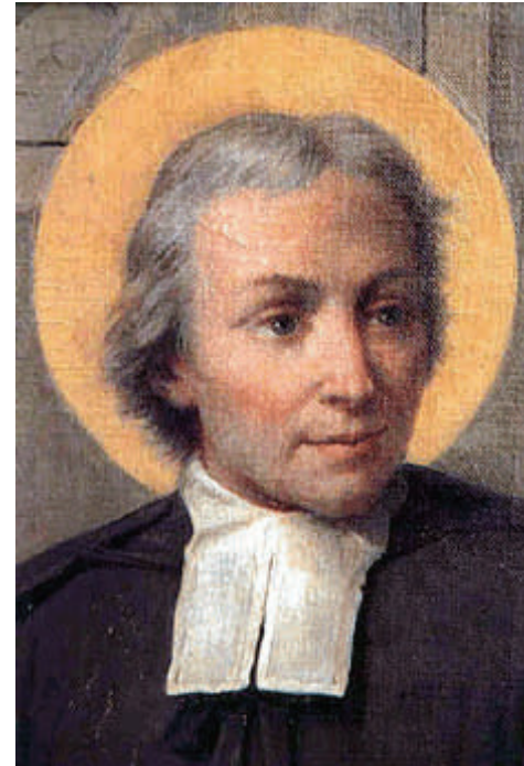
ST. JOHN BAPTIST DE LA SALLE 1651-1719

St. Bridget Chinese Catholic Church Los Angeles